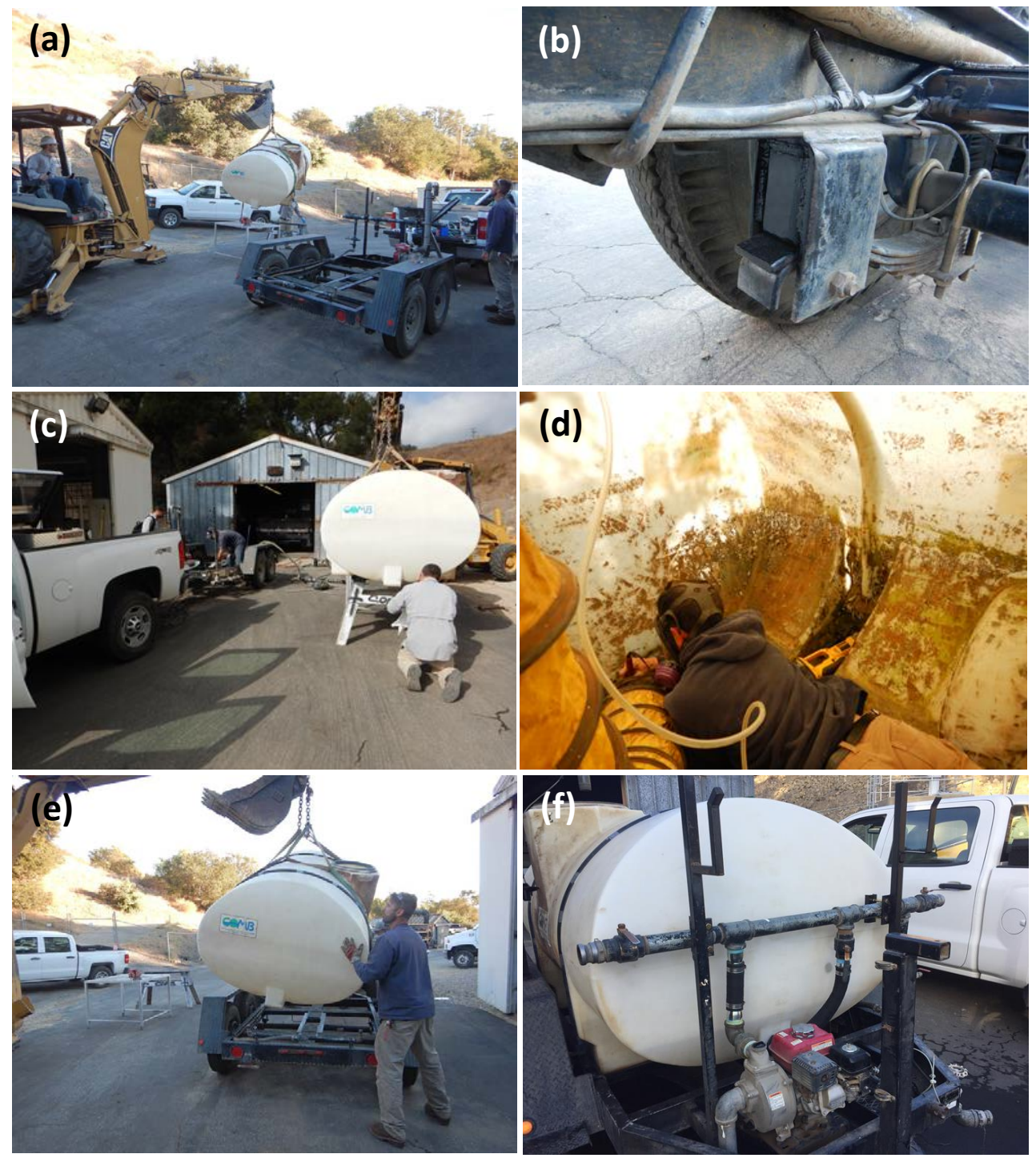
Exhibit 1: Water trailer maintenance showing (a) removal of tank, (b) new suspension welds, plastic welding (c) outside of the tank and (d) inside of the tank, (e) placing the tank on top of new trailer carpet, and (f) new hose and pipe connectors.