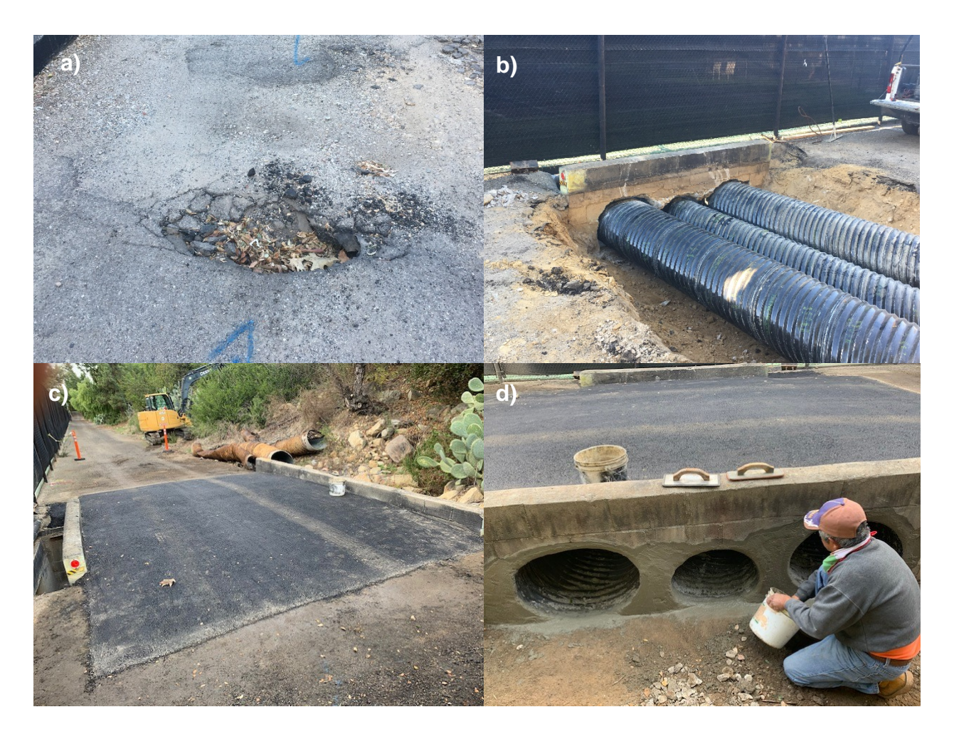
Figure 4. Sheffield Control Station Access Road Culvert Repair - a) Sinkhole starting to form in roadway over the South Coast Conduit alignment due to collapse culvert; b) new polymer-coated corrugated steel culverts that should better resist future corrosion; c) slurried and paved portion of the access road over the new culverts. Note: the rusted condition of the corroded culverts in the background; and d) repair of headwall.

COMB maintains an access road to the Sheffield Control Station on the north side of the Santa Barbara Tennis Club. A storm drain channel from Highway 192 routes under the access road through three corrugated metal culverts and then beneath the tennis courts. The corrugated metal culverts were corroded and a small sinkhole was forming in the access roadway where a culvert had collapsed directly over the South Coast Conduit.. In order to protect the South Coast Conduit and the tennis courts from damage, the culverts on the access road needed to be replaced. Peter Lapidus Construction (lowest responsible, responsive proposer) was able to replace the culverts in mid-January just prior to the January 27<sup>th</sup> to 29<sup>th</sup> storm event (Figure 4). The culverts were replaced inkind, however the new culverts purchased contained a polymer coating and were set in slurry vs sand bedding to better prevent future corrosion.