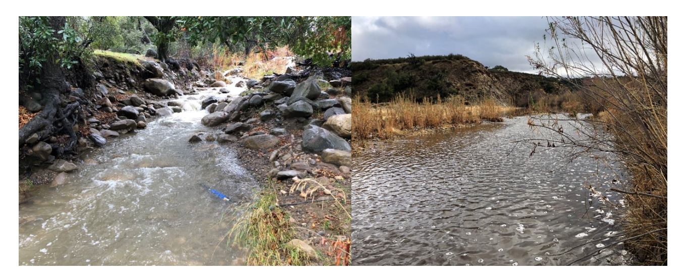
Figure 2. Tequipis Creek (left) and Santa Ynez River at Live Oak (right) Water Quality Sampling Locations – January 29<sup>th</sup>, 2021.