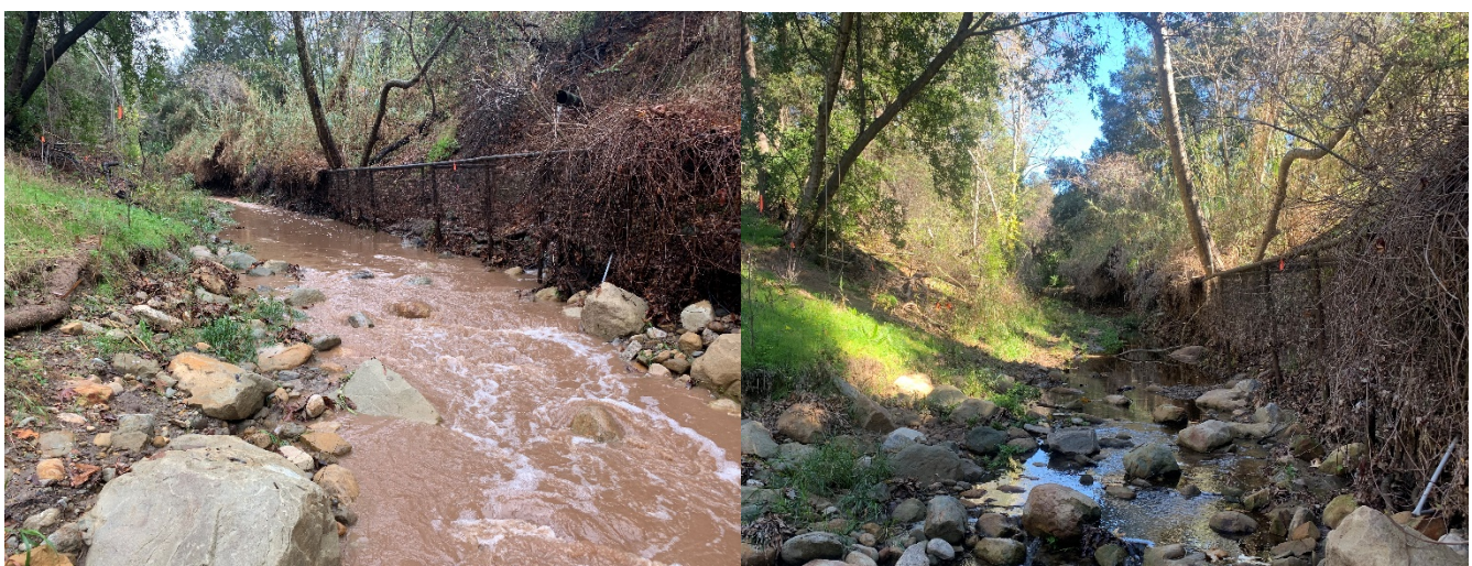
Figure 5. South Coast Conduit Crossing of San Jose Creek on 1/29/21 (left) and 2/12/21 (right)