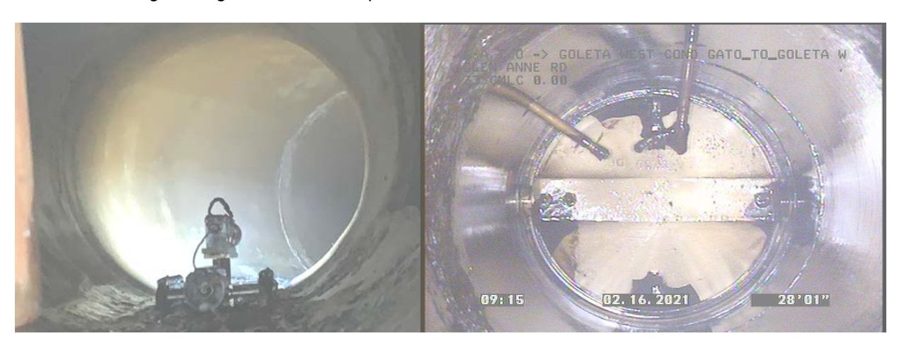
Figure 3 . Goleta West Conduit – Video Camera Inspection – Inspection camera (left) and bottom of Glen Anne Turnout - Butterfly Valve #5. Mortar lining in good condition and tight seal achieved with Butterfly Valve #5.

Water from the South Coast Conduit is delivered to Goleta Water District and the Goleta West Conduit at Glen Anne Turnout. During the Modified Upper Reach Reliability Project in 2012, the Goleta West Conduit pipeline was exposed immediately downstream of the turnout box. The exposed mortar coating on the outside of the pipe has subsequently cracked and is in need of repair. A video inspection was conducted by Houston and Harris (outside consultant) inside the pipeline from Station 22+23 to 22+65 on February 16<sup>th</sup>, 2021 (Figure 3). The inspection was coordinated and conducted during a planned shutdown of the Goleta West Conduit by Goleta Water District. The initial inspection results indicate that the inside mortar-lining of the pipeline is in good condition. The video inspection results will be reviewed by Phoenix Engineering (consultant engineer for external repair) and COMB plans to move forward with the proposed repair of the external mortar coating in the next several weeks, pending the additional engineering review of the inspection results.